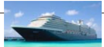
10-Day Cruise Aboard Holland America's ms Noordam